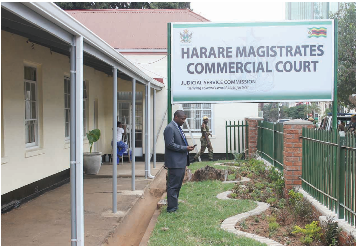
Harare Magistrates' Commercial Court building