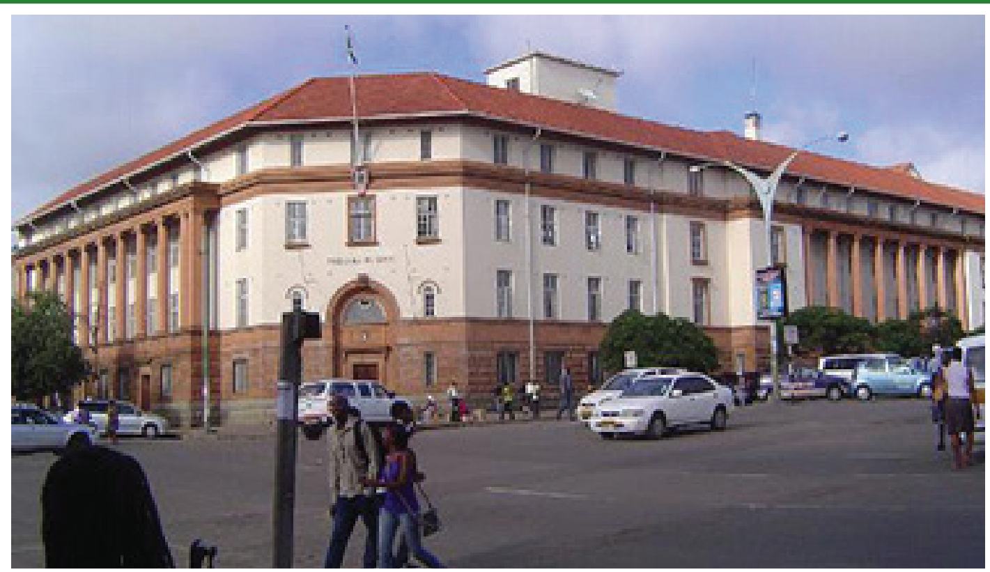
Tredgold Magistrates Court, Bulawayo