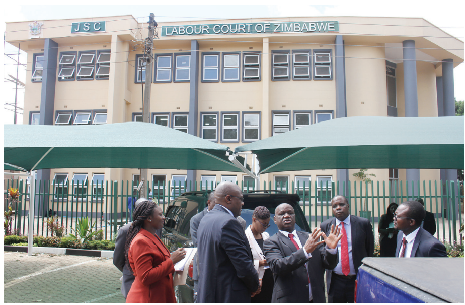
Chief Justice and the JSC secretariat tour the new Labour Court building in Harare

Some minor problems were solved right away with the Chief Justice directing the secretariat to take immediate action.