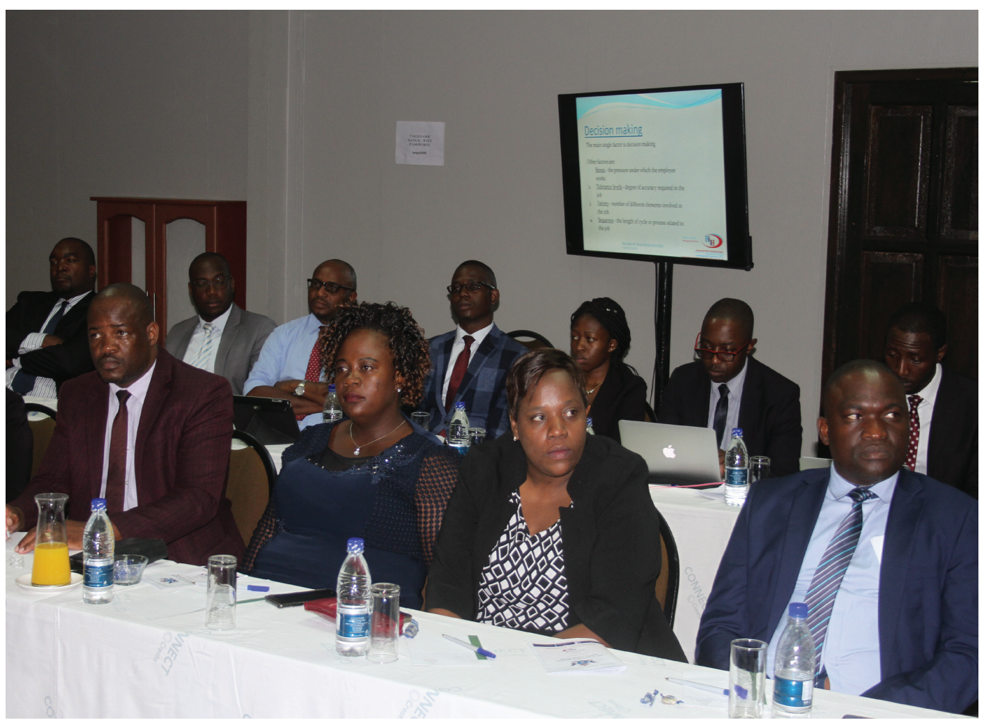
JSC staff attend a job evaluation workshop in Harare recently

when it is done in-house. This was the rationale behind engaging an external consultant. The Commission decided to plug that hole through incorporating Job evaluation specialists. And it enlisted Head Hunters International to assist the Commission carryout this noble process.