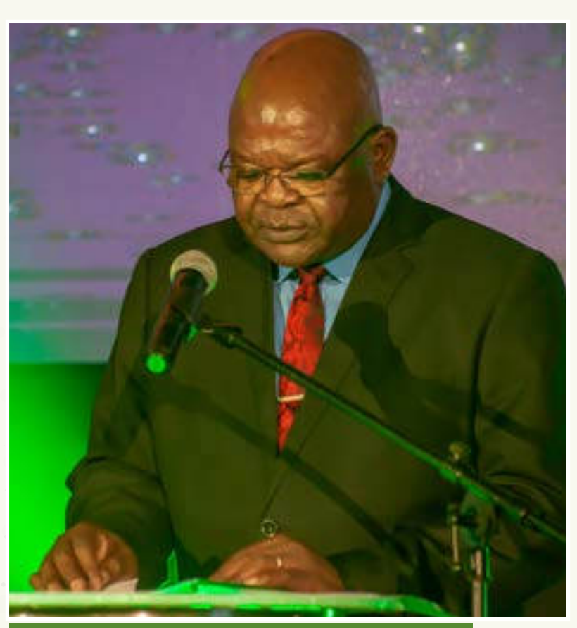
The Commissioner General of Police, Mr. G. T Matanga

As the Zimbabwe Republic Police I can testify that we stand to benefit the most from all these developments. Increasing the number of courts ensures that cases are brought before the courts and heard expeditiously