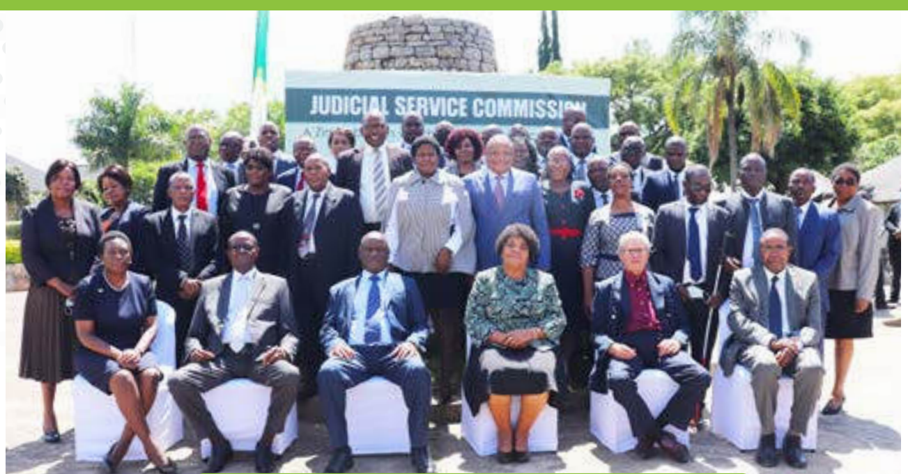
Scenes from the Judges' end of first quarter Symposium in Masvingo