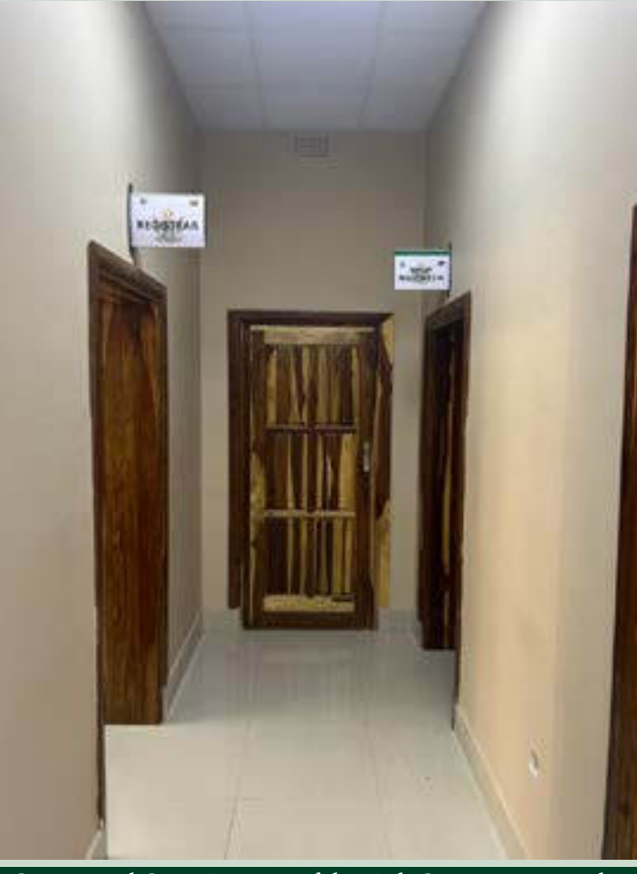
Commercial Court Division of the High Court nears completion

Lupane Magistrates' Court under construction